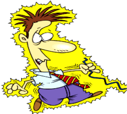
Known for poor decisions