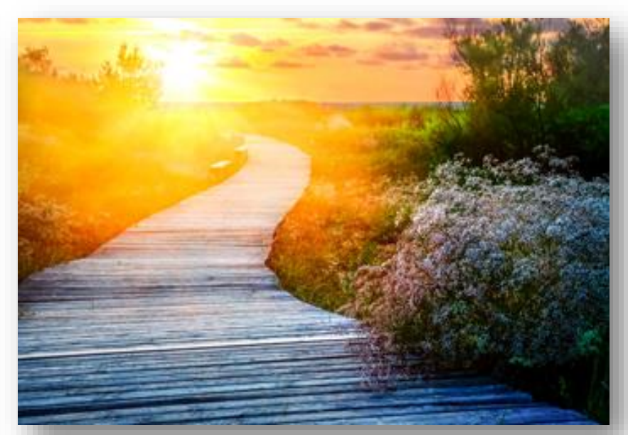
"Brighter the way grows every day.." Isa 35:8 Holy highway Prov 4:18 Grow brighter