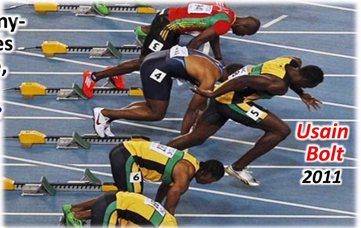
Usain Bolt 2011

2Tim2:5 if anyone competes as an athlete, he does not win the prize unless he competes according to the rules.